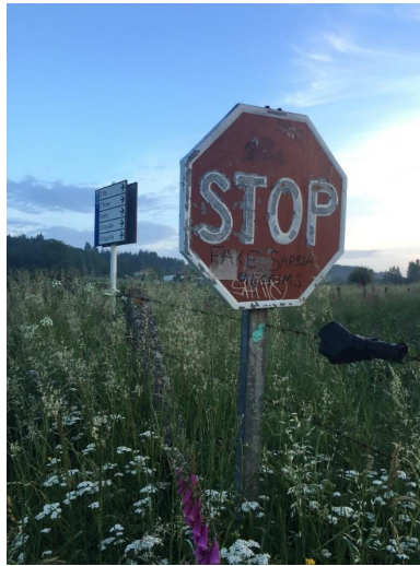
Figure 5: “Stop fake Sarria pilgrims.”

position in the pilgrim hierarchy: they reinforce these tacit rules, and sometimes turn them into written ones. As mostly middle-aged Spanish men, they match the demographics of the Catholic ritual masters (priests) with which so many spiritual but not religious pilgrims take issue. The ritualized way of life on the Camino allows for exchanges of power between hosteleros , experienced pilgrims, and those new to the Camino.