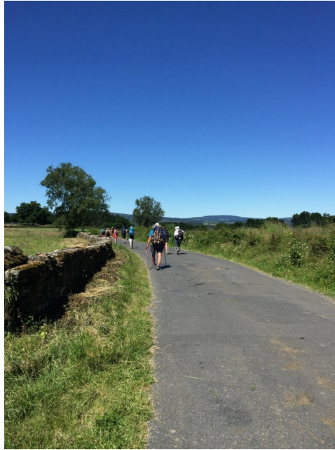
Figure 4: The Camino after Sarria, about 100 km (62 miles) before Santiago.

Glenn tend to look down on them. As I walked, I passed graffiti on a stop sign that said, “Stop fake Sarria pilgrims” (Figure 5). Another read, “Jesus didn’t start in Sarria!”