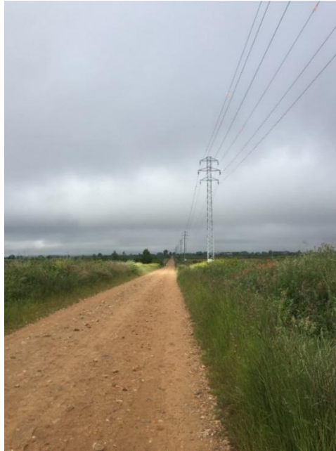
Figure 3: The Camino near León, about 240 km (150 miles) before Santiago. A solitary pilgrim can be seen in the distance.