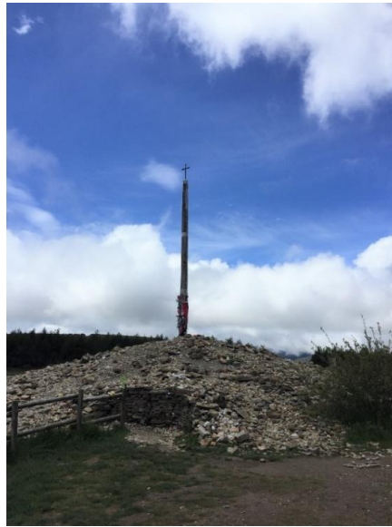
Figure 1: La Cruz de Ferro

It was really reverential. It was really quiet... in a special way I can't describe. It was just a special moment. And I put my stones down, and I put a photograph, and I stayed for a little while. And then I walked on... I was walking above the clouds... It was Sunday morning, and it was a beautiful day. I felt like I was walking on air. I felt like I had taken stones—literally taken bricks out of my rucksack. But it was like a real heaviness had lifted. And I felt better. And I've felt better since. I just feel a bit indifferent about [my ex-husband], whereas before I would have seen him struck by a bolt of lightning. I don't know. I just feel like I wish him well—get on with it.