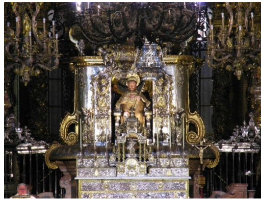
Figure 2: The statue of St. James that pilgrims can hug.