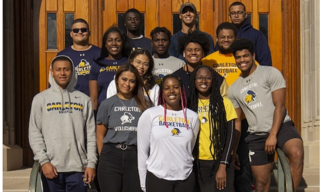
Black Student-Athletes of Carleton annual family photo. Look at the growth! The BSAC's first year had 13 athletes and now they have 23 athletes across 6 sports. Not everyone could make the photo shoot, but what a group this is!

MOSAIC welcomes new board members, fundraises for charity organizations in India, and organizes weekly Chai Times and Diwali festival. To learn more about MOSAIC, read the news story .