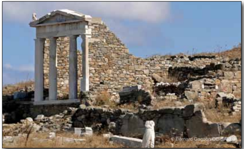
Above, the Temple of Isis on Delos. Below (1), the Library of Celsus at Ephesus, Turkey. Below (2), a seafood restaurant on Naxos, Greece. Bottom, our 26-cabin ship docked at Patmos, Greece.

Rugged, volcanic Patmos is most notable as the place where one of the twelve apostles, St. John the Evangelist, is said to have received his vision of fire and brimstone and dictated the Book of Revelation. This morning we visit the Monastery of St. John and the Holy Cave of the Apocalypse, a UNESCO World Heritage site, to see where the holy man lived and worked, followed by a short walk through Patmos Town. After lunch onboard, enjoy free time to stroll around the quaint harbor town of Skala before returning to the ship for dinner. Late this evening we begin cruising toward Santorini. (B,L,D)