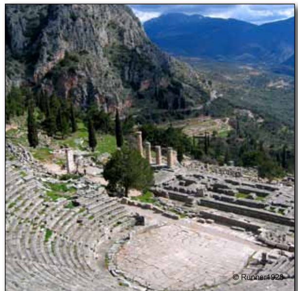
Above, the theater at Delphi, site of the ancient Greeks' most important oracle. Below, one of the many medieval monasteries built atop the pinnacles of Meteora.

Perched precariously atop towering rock columns, the Meteora ("rocks in the air") monasteries are truly awe-inspiring and a UNESCO World Heritage site. Tenth-century ascetics sought peace in the many caves, and the first monastery was built in 1336. A winding road provides access to several in their splendid isolation; examine their paintings, carvings, and icons. Have lunch on your own, then discover a Byzantine tradition during a visit to a nearby icon-painting workshop. This evening, a local Greek family will host us for dinner at their home. (B,D)