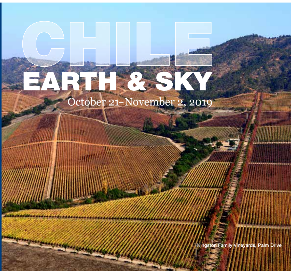
Kingston Family Vineyards, Palm Drive