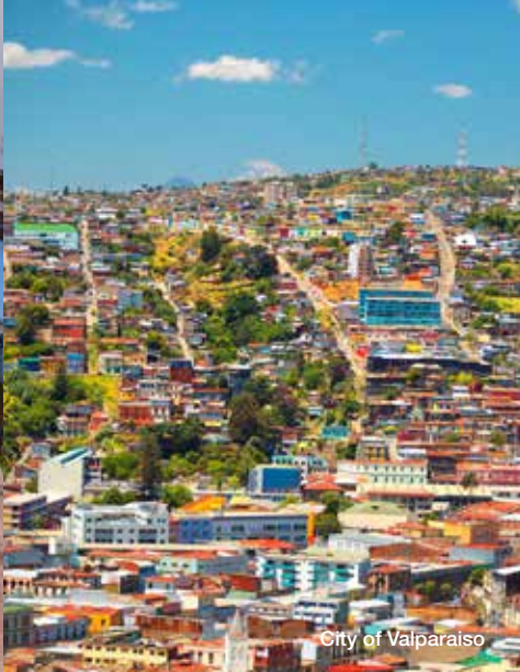
City of Valparaiso