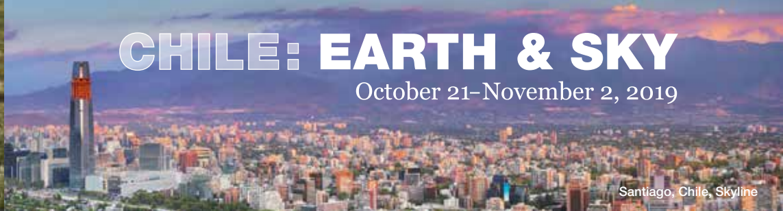
Santiago, Chile, Skyline