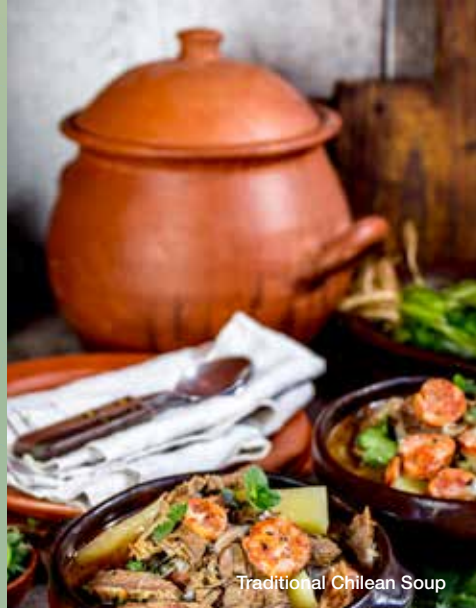
Traditional Chilean Soup