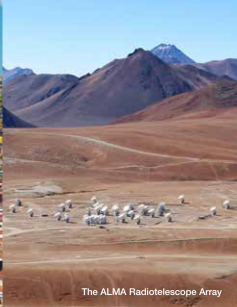
The ALMA Radiotelescope Array