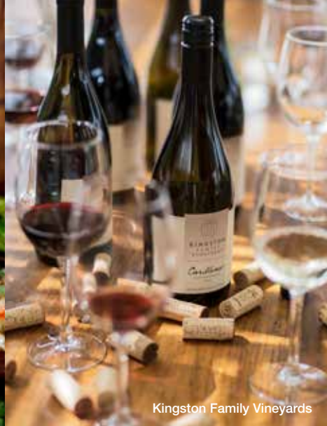
Kingston Family Vineyards