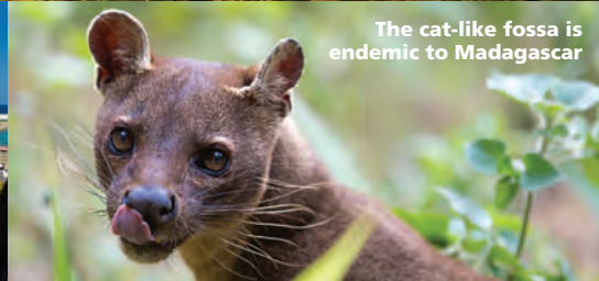
The cat-like fossa is endemic to Madagascar