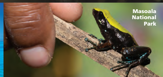
Masoala National Park