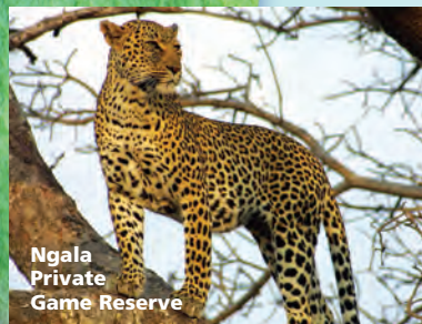
Ngala Private Game Reserve