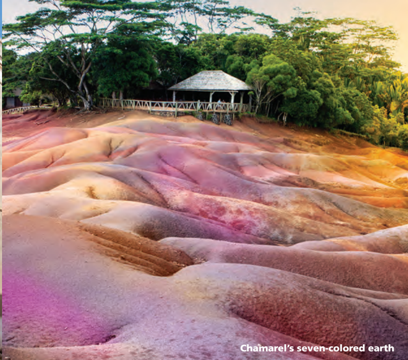
Chamarel's seven-colored earth

climb aboard a 4x4 vehicle to drive to Amber Mountain National Park for tropical rainforest walks. See lush flora and waterfalls, look for the crowned lemur, spot volcanic lakes, and count more than 40 varieties of butterfly.