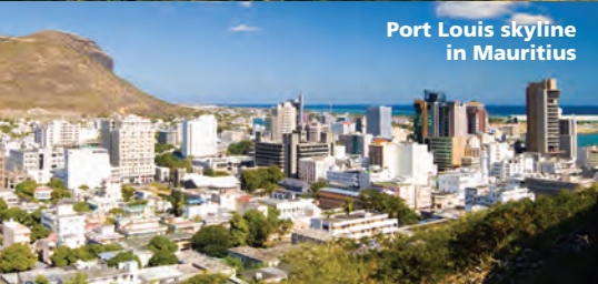
Port Louis skyline in Mauritius