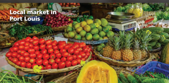
Local market in Port Louis