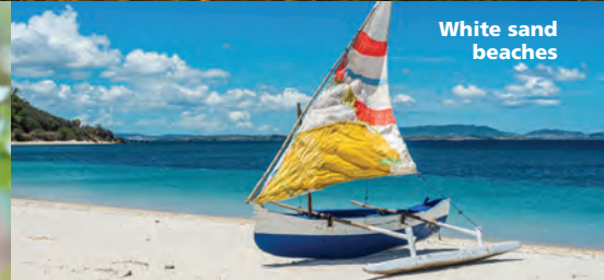
White sand beaches