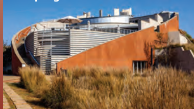
Maropeng Exhibition Centre

Further details and pricing will be sent to confirmed participants.