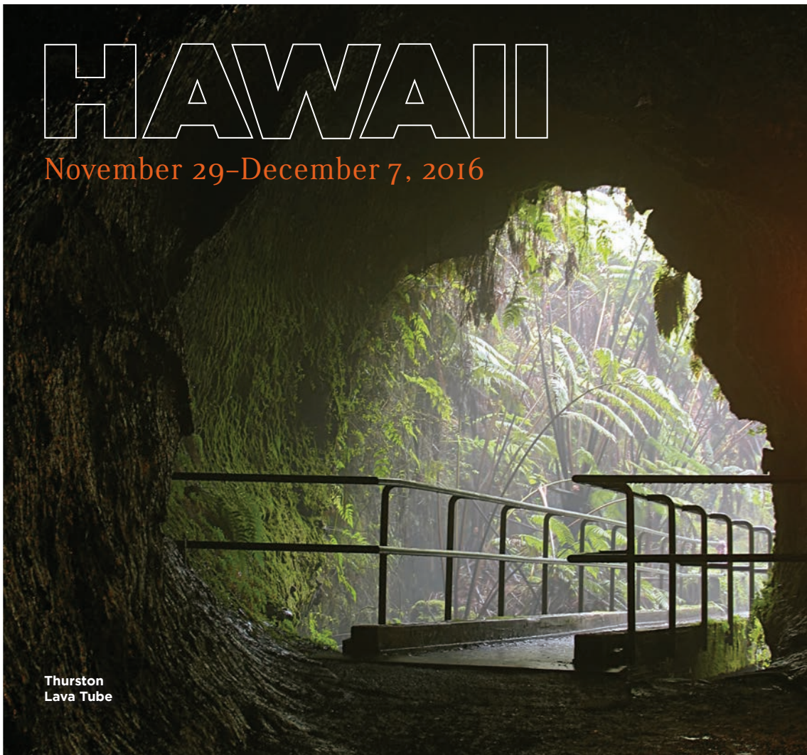
Thurston Lava Tube