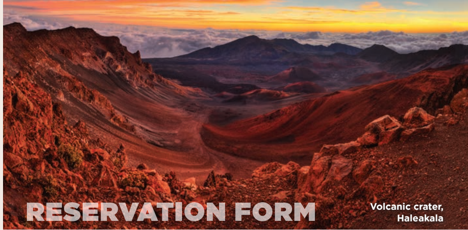
TELESCOPE (cover) ; WHALE TAIL ; MOUNTAIN TERRAIN ; SEA TURTLE ; LAVA ; HOLEI SEA ARCH ; LAVA FIELDS ; VIEW FROM MAUNA KEA ; SILVERWORD PLANT ; TELESCOPE INTERIOR ; WATERFALL ; KONA COAST ; BREACHING WHALE ; VOLCANIC CRATER ; NENE ; THURSTON LAVA TUBE ; TELESCOPES (back cover). PWV BIRD.

California Seller of Travel Program CST #2088800-40