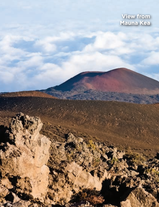
View from Mauna Kea