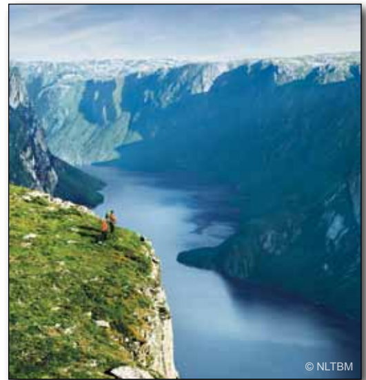
Previous page and above, views of Gros Morne National Park, Newfoundland, a UNESCO World Heritage site. Below, the Atlantic Puffin is commonly seen along the coast. Bottom, “The Arches” en route to St. Barbe.

Today we take the Labrador ferry back to Newfoundland and, along the way, get our last look at Labrador’s whales, seabirds, lighthouses, and seals. Upon arrival in St. Barbe, Newfoundland, travel to L’Anse aux Meadows to visit the only authenticated Viking site in North America. From here we can look out at Belle Isle, the northern extreme of the Appalachians, the backbone of this continent. Late this afternoon, take a boat trip out of St. Anthony for viewing dolphins, whales, and other wildlife (sometimes icebergs, too) off of the dramatic coastline. Dinner is at our hotel this evening. Overnight in St. Anthony at the Haven Inn. (B,L,D)