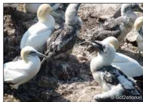
Above, gannets and their chicks. Below, St. John's. Bottom, a whale sighting in Witless Bay.

Today we drive to Cape St. Mary's Ecological Reserve, where we will visit the continent's second-largest gannet colony for spectacular views of these majestic seabirds tending their chicks. At this wonderfully accessible seabird colony, the full spectacle of tens of thousands of seabirds, including the world's most southerly thick-billed murre, is only a twenty-minute hike from road's end. Gannets, kittiwakes, and murre with their chicks take up every available space in this seabird paradise. Often this site offers excellent land-based humpback whale watching. We will also explore some of the boreal forest, visit salmon rivers, and stand on the rugged coast that represents the southern boundary for the distribution of some high Arctic plants and animals. (B,L,D)