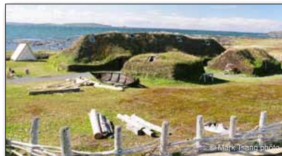
Above, a Norse long house excavation, L'Anse aux Meadows. Below, a modern Basque chalupa, Port au Choix National Historic Park.

Transfer to the Deer Lake airport this morning for flights homeward, or onward to St. John's (airport code: YYT) for those participating in the optional extension. If your flight schedule allows, you may first choose to explore some of Corner Brook from our well-located hotel. (B)