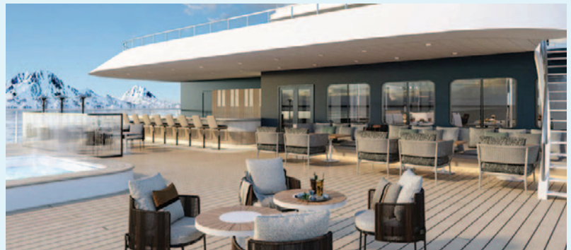
Café/Bar with swimming pool

Currently under construction in Finland, and scheduled to be delivered in October 2021, Swan Hellenic's Minerva is a new-generation expedition cruise ship. Although at 10,500 tons the ship is large enough to accommodate more than 250 passengers, Minerva will accommodate a maximum of 152 guests in 76 spacious staterooms and balcony suites. The low guest density results in one of the most generous indoor and outdoor space-to-guest ratios among cruise ships.